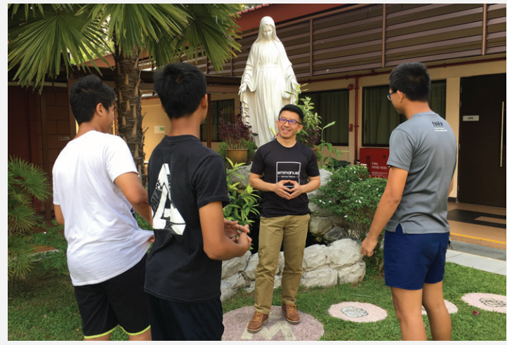
Roland's regular chat session with the boys in residence

Using various approaches and interest-based programmes, youth workers engage and build rapport with youths, connecting