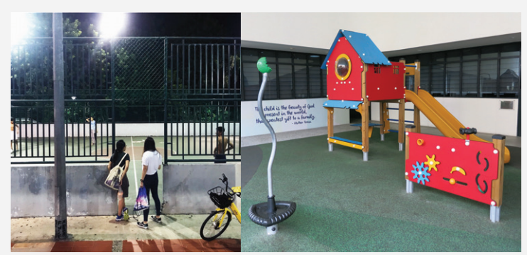
YouthReach staff visiting regular youth hangouts