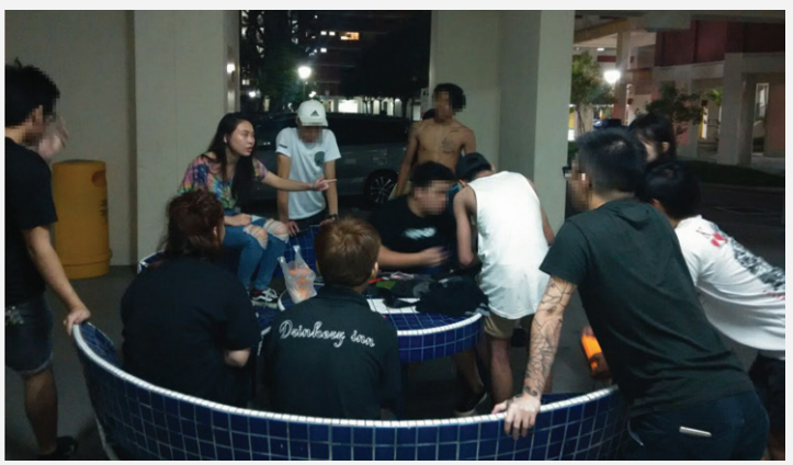
YouthReach workers befriending youths they meet on the streets

Boys' Town continues to evolve, staying relevant to better meet our society's needs.